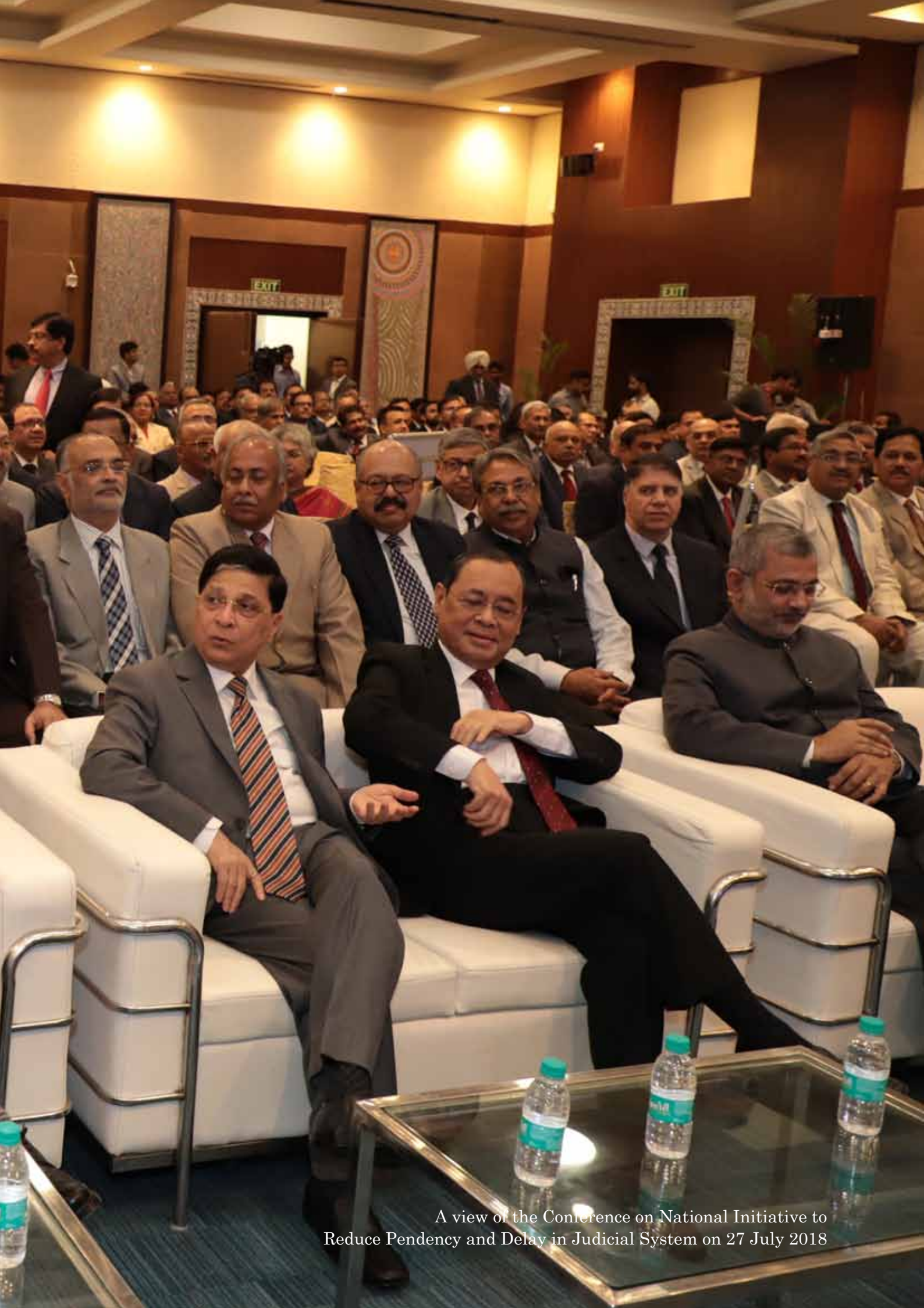
A view of the Conference on National Initiative to Reduce Pendency and Delay in Judicial System on 27 July 2018