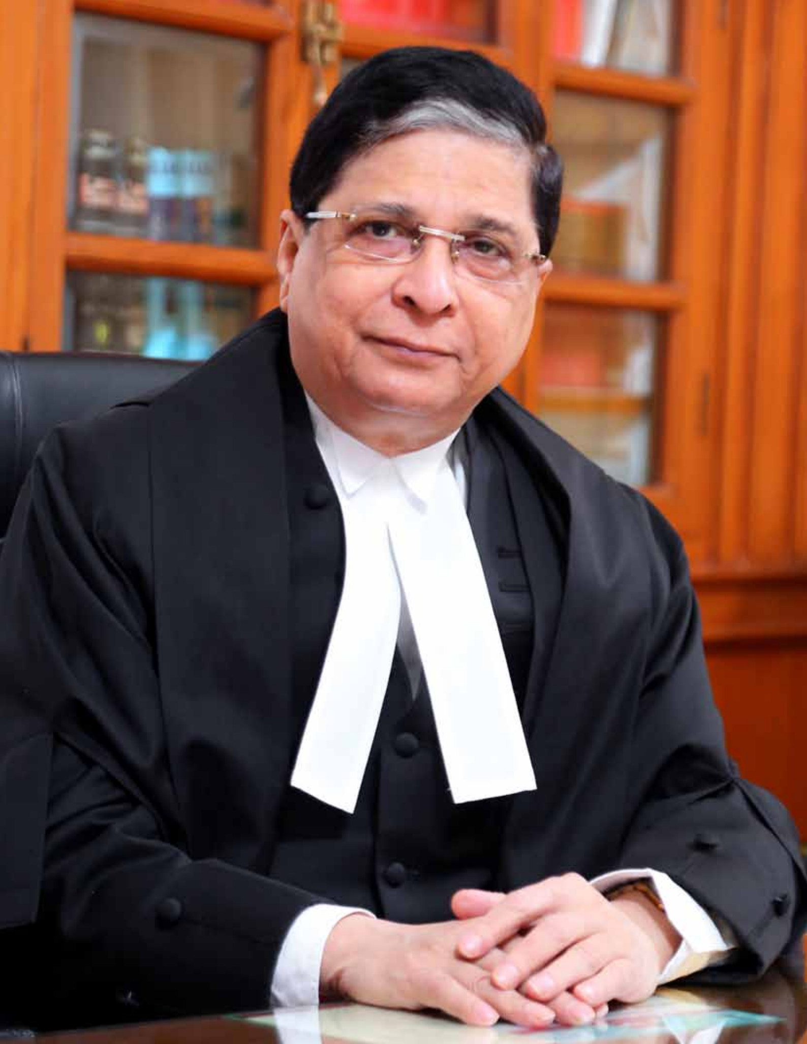
Hon'ble Shri Justice Dipak Misra Chief Justice of India