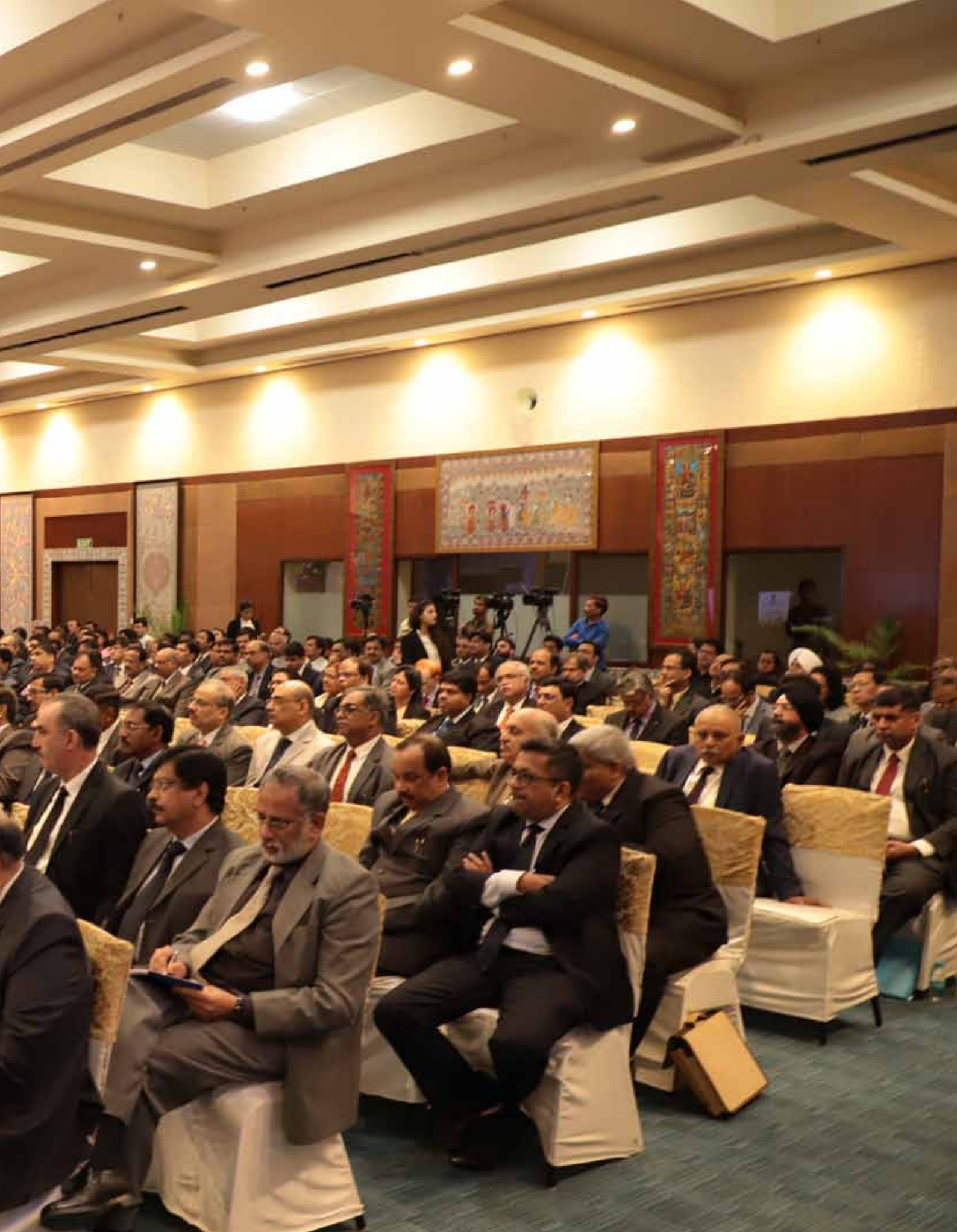
Participants in the Conference on National Initiative to Reduce Pendency and Delay in Judicial System on 27-28 July 2018